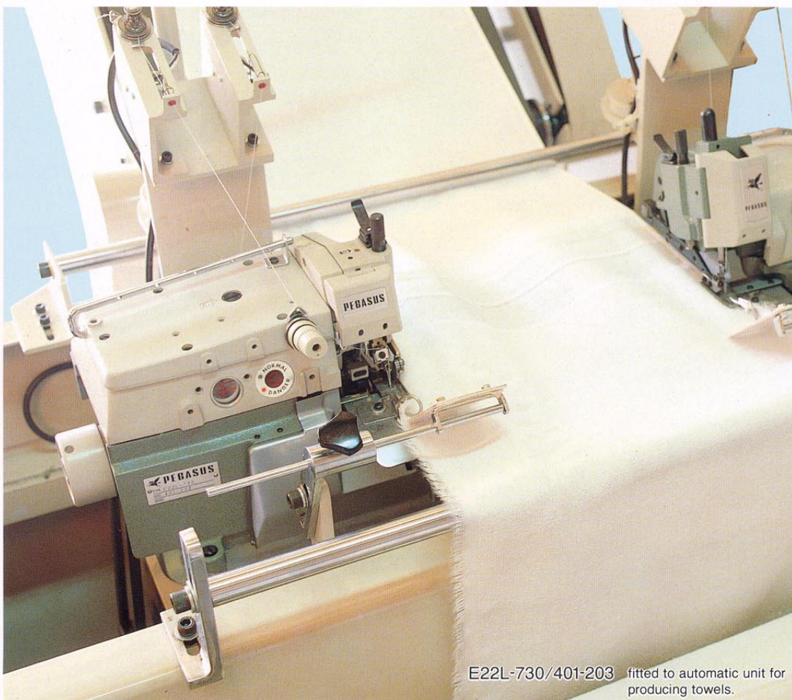
E22L-730/401-203 fitted to automatic unit for producing towels.

LEFT-HANDED MACHINES-A WORLD FIRST FOR PEGASUS.